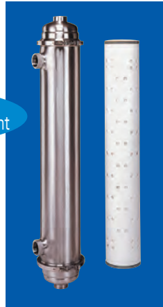
内圧循環式中空糸膜 Internal pressure circulation type hollow-fiber membrane