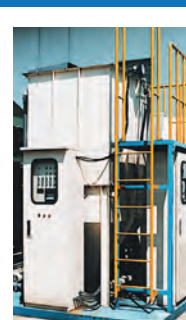
外圧浸漬式中空糸膜装置 External pressure immersion type hollow-fiber membrane equipment