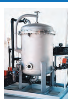
外圧全ろ過式中空糸膜装置 External pressure dead-end filtration type hollow-fiber membrane equipment