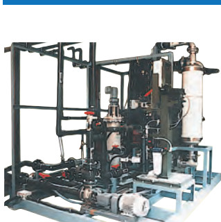
外圧循環式中空糸膜装置 External pressure circulation type hollow-fiber membrane equipment

用途に応じて最適の膜モジュールを採用します Adoption of optimal membrane modules for each application