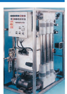
外圧全ろ過式中空糸膜装置 External pressure dead-end filtration type hollow-fiber membrane equipment