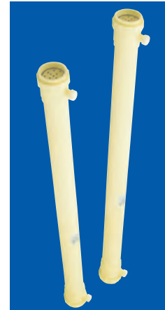
外圧循環式中空糸膜 External pressure circulation type hollow-fiber membrane