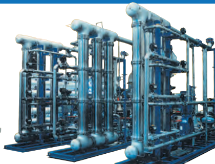
内圧循環式セラミック膜装置 Internal pressure circulation type ceramic membrane equipment