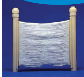
外圧浸漬式中空糸膜 External pressure immersion type hollow-fiber membrane