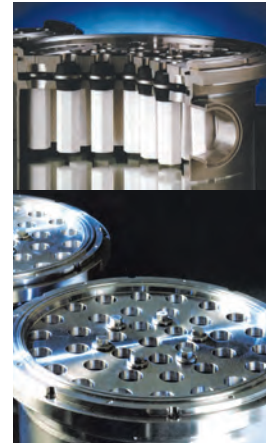
内圧循環式セラミック膜 Internal pressure circulation type ceramic membrane

原水質及びご要求水質レベル(0.001~1.0NTU)により下記種類から選定致します